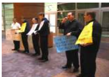
Seminarians at America's Center on October 8

Instead of giving up hope, the seminarians lined up at each entrance to the building holding up signs proclaiming their pro-life message. Even with much dissent from partygoers, the seminarians remained standing their ground from around 6:00 p.m. to 11:30 p.m. Many partygoers taunted the seminarians, saying such phrases as "You can't impose your religious beliefs on me!" One party attendee was so bold as to take a sign out of the hands of a seminarian and proceed to rip it into pieces in front of him.