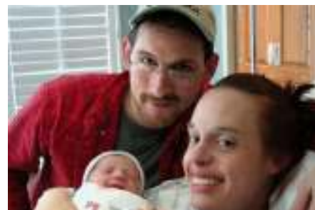
The happy family on October 13.