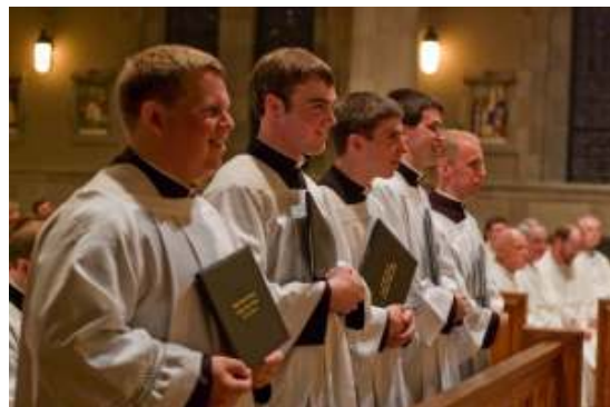
The five members of the Cardinal Glennon Graduating Class of 2007.