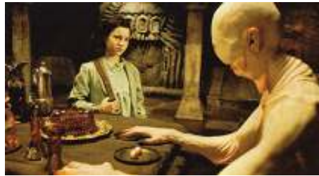
A studio still from the 2006 Guillermo del Toro film Pan's Labyrinth .

The second vow: chastity or celibacy. The priest renounces an earthly bride and takes instead the Church, investing all his energy into his love for it. The film takes a cue from the well-known Babette's Feast for this vow: Ofelia is presented with a glorious banquet (an analogy Christ frequently employed), and as long as she does not