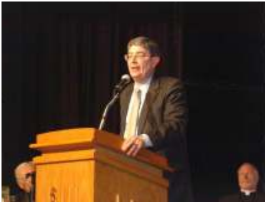
George Weigel addresses a full house at the March 23 Peter Richard Kenrick Lecture. Mr. Weigel's lecture, entitled "Pope Benedict XVI and the Catholic Future: A Global View," served as the eleventh entry in this esteemed speakers' series.